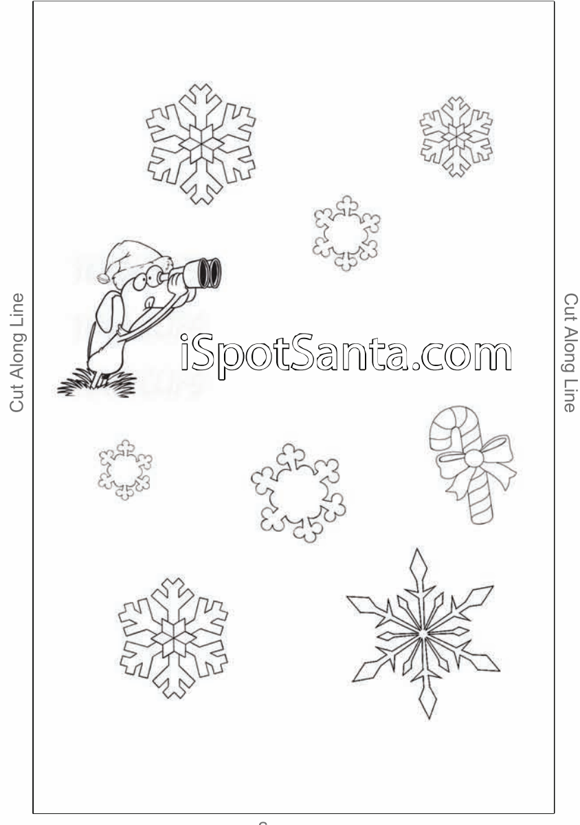
Cut Along Line